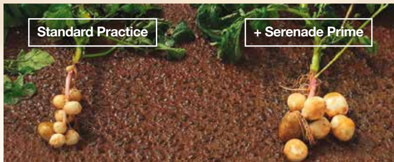
Golden Delight, Far North QLD

Queensland and Tasmanian results showed higher potato yields in several varieties. Golden Delight (below) showed improved early tuber set.