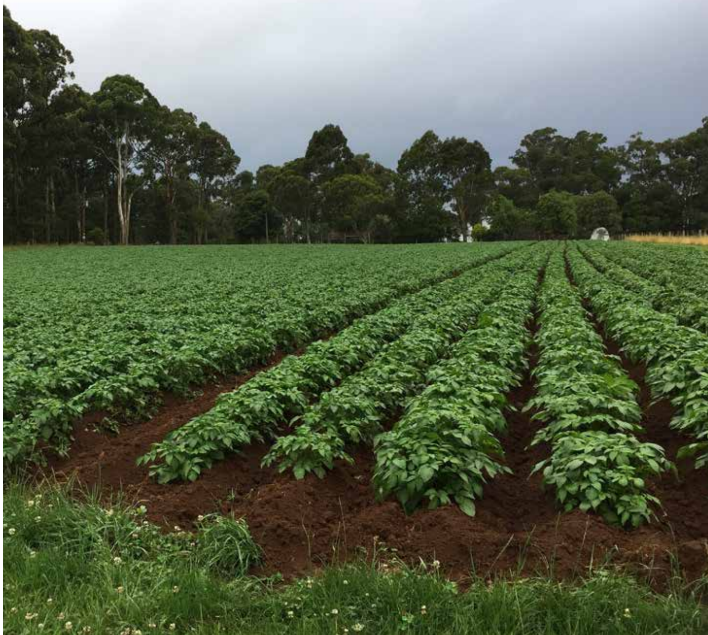
Kinglake potatoes early emergence