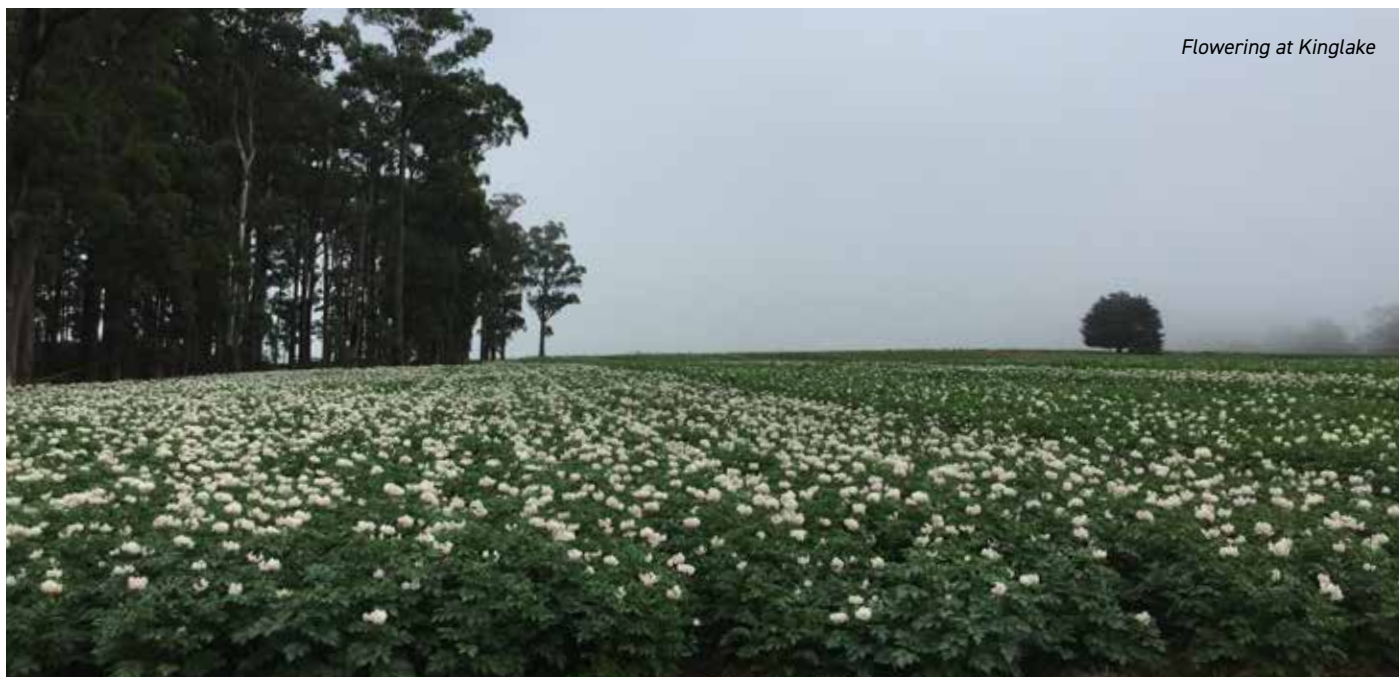
Flowering at Kinglake